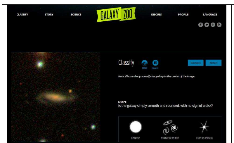
Figure 1: Volunteer Interfaces for Zooniverse Projects