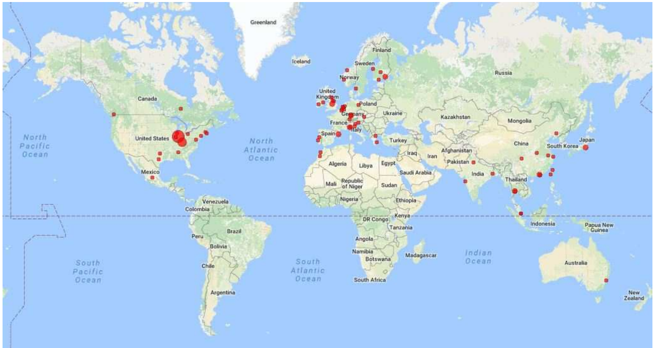
Figure 2 Geographical Location of Contributing Organizations (Using gpsvisualizer.com)