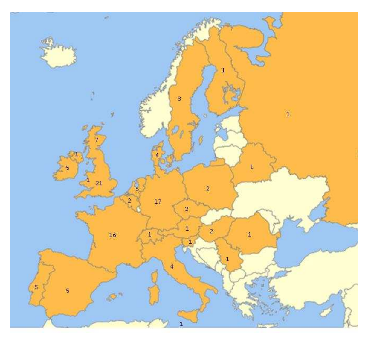
Figure 2 – Unique participants from rounds one and two