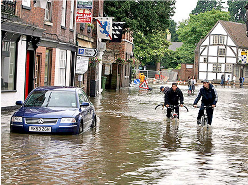
Fig 2. The cycle of recovery