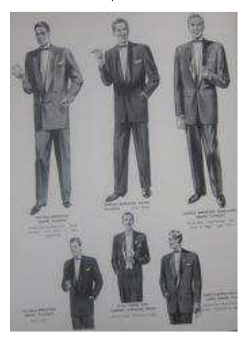
Figure 13: 1950's tailoring brochure.

produced tailoring comes from manufacturers and is graded to standard size specifications used by the fashion industry. The students followed a similar process as they produced tailored garments inspired by the menswear for sample UK womenswear size 12 and menswear size 38. Students are instructed about the use of canvassing, interfacing and padding that make up the inside of a garment to give it its tailored appearance, yet produce their garments by machine in a mass manufactured way. Other artefacts from the archive included leaflets and brochures from the 1930s to the 1970s that marketed and promoted the Leeds tailoring companies (figure 13), these included patterns, garments (figure 14), photographic records of factories and tailors at work, archive fabrics and industrial machinery.