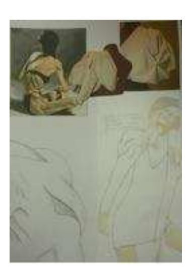
Figure 3: Example of poor analysis of research.

The work in figure 3 is a poor example of research, the page from the sketchbook is shallow and visually confusing, there is a postcard of an emaciated female figure that contrasts with the sketch of the healthier figure, there is also a photograph of the student's own manipulation of calico that mimics the skeletal folds of the body in the postcard.