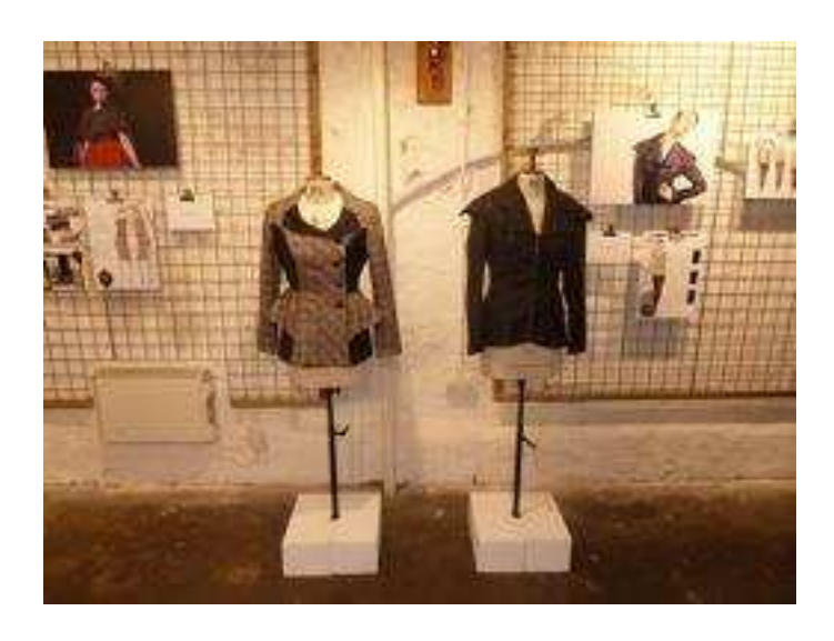
Figures 17, 18 and 19: Photographs of 'Cut, Cloth and the Luxury Brand'. The student curated exhibition that combined the Leeds tailoring archive with contemporary tailored design and promotion work from the students.

Under the title 'Cut, Cloth and the Luxury Brand' the exhibition highlighted that: