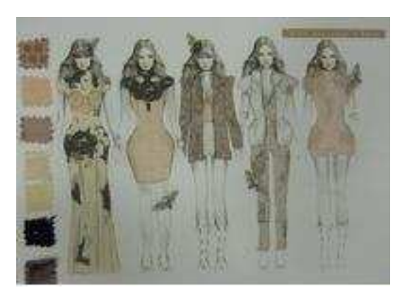
Figure 2: Collection of garment drawings resulting from example of good analysis of research (figure 1).

The work in figure 3 is a poor example of research, the page from the sketchbook is shallow and visually confusing, there is a postcard of an emaciated female figure that contrasts with the sketch of the healthier figure, there is also a photograph of the student's own manipulation of calico that mimics the skeletal folds of the body in the postcard.