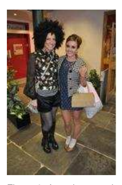
Figure 6: A student wearing a 1970's Afro wig.