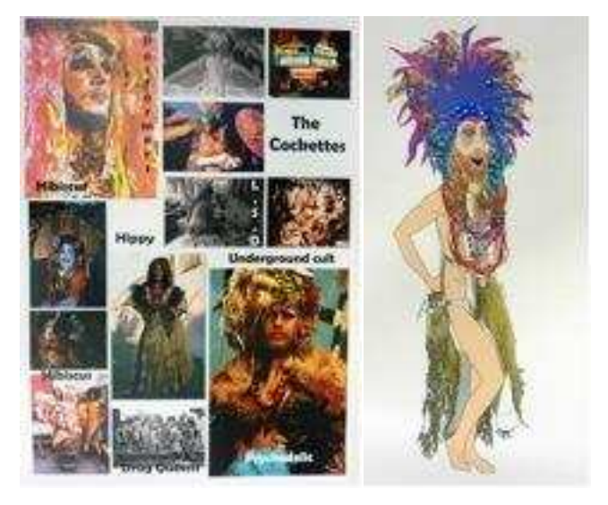
Figures 9 and 10: Mood board and design based on The Cockettes.

Although the project was basic in its requirements students felt enriched by their symposium experience and in general their enthusiasm and increased knowledge resulted in more in-depth visual research and design solutions. Mood boards are fundamental tools used to convey research ideas in the design industries, considered 'A vital part of the design process, facilitating creative and innovative thinking and application' (Cassidy 2011: 225). In this case they were used to convey research into historical aesthetics in order to design for the future. As one student commented: