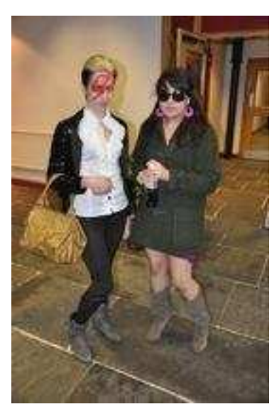
Figure 5: A student with 'Aladdin Sane' make-up.

article 'We Love the 70's', (Avansino 2011). One student wore David Bowie's distinctive 'Aladdin Sane' make-up and hair from 1973 (Bowie 1994: 1) see figure 5, another sported a huge 1970's Afro wig (figure 6) and another emulated the peroxide blonde glamour of 1970's icon, Debbie Harry (figure 7).