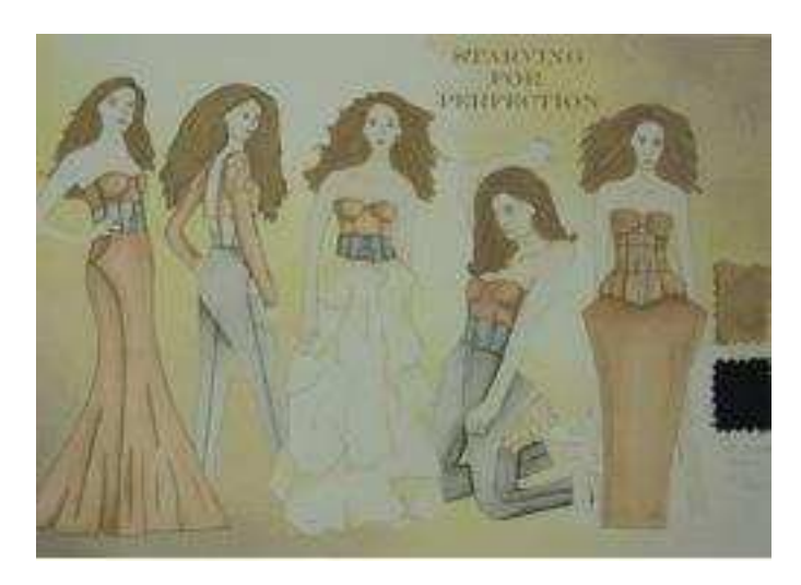
Figure 4: Collection of garment drawings resulting from example of poor analysis of research (figure 3).

The idea for the collection (figures 3 and 4) was based on anorexia however this is not clearly demonstrated through the research and the subsequent designs, which appear rather voluptuous.