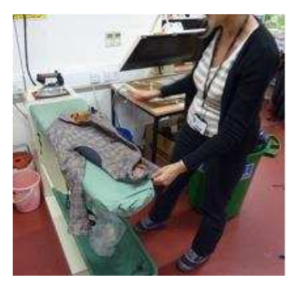
Figures 15 and 16: Students working on tailored jackets.

The final exhibition enlivened the archive and showcased combinations of the historical and contemporary student work. Students on the BA (Hons) Fashion Communication and Promotion course used both the archive and student garments to show how the qualities inherent in the West Yorkshire tailoring tradition were relevant by creating ideas for lifestyle brands using the jackets. Both the jackets and the design and promotional material were mingled to emphasize how the past had been raided in order to design for the contemporary (figures 17, 18 and 19).