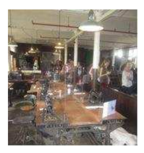
Figure 11: The interior of the Leeds Industrial Museum.

The costume curator wanted to revitalise the displays, her idea was for the students to create tailored fashion garments that reflected the heritage of the industry and to curate an exhibition that combined their garments with those from the archive, demonstrating how raiding from the past could inspire a forward thinking fashion collection. In a similar way to the 1970's symposium, this project was important because it provided the students with multiple research opportunities, beyond the visual that enriched their wider knowledge. It included investigating the importance of Leeds in the design and production of men's fashion in the period after the Second World War and drew on the valuable collection of menswear held in Leeds Museums and Galleries. It also linked the history of menswear to an understanding of consumerism in post-war Britain and the impact of this on fashion and design. With its focus on ready-to-wear garments and designer-shaped high street fashion, the students' investigations counterbalance much existing practice that associates fashion with high-end ready-to-wear and couture. The project also highlights the contribution of Leeds manufacturers such as Hepworths and Burtons to social changes in fashion in the post-war decades. The students had the opportunity to listen to a talk from the costume curator Natalie Raw as she guided them through the archive and the industrial museum.