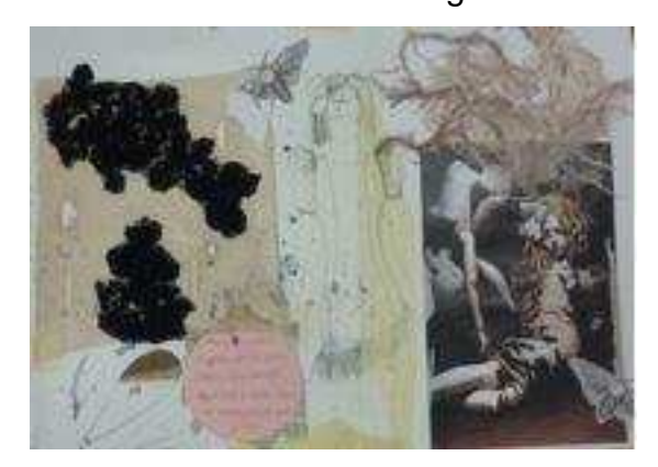
Figure 1: Example of good analysis of research.

Teaching students how to conduct research successfully is challenging. We live in an instant culture in which it is easy to access visual information, predominantly through the internet. As Allen and Evans (2011: 4) said: 'The 'Google generation' are about to enter higher education. This generation is often criticised for skittering their way through continuous streams of information, constantly multitasking and never focusing in on any one thing for long'. It has to be emphasised to students that this is only secondary information and is predominantly another's work. It is also a challenge to help students understand the relevance of both primary and secondary research and how this can be analysed and developed into a successful art or design proposal. The illustrations below from fashion students demonstrate both successful and poor analysis of research. Both students have developed collections of co-ordinated outfits from their sketchbook references. Figure 1, is a good example, the page from the student's sketchbook demonstrates fabric experimentation, a surreal photograph of a doll, experimentation with colour and texture, drawings of insects and her own rough notes and sketches of designs.