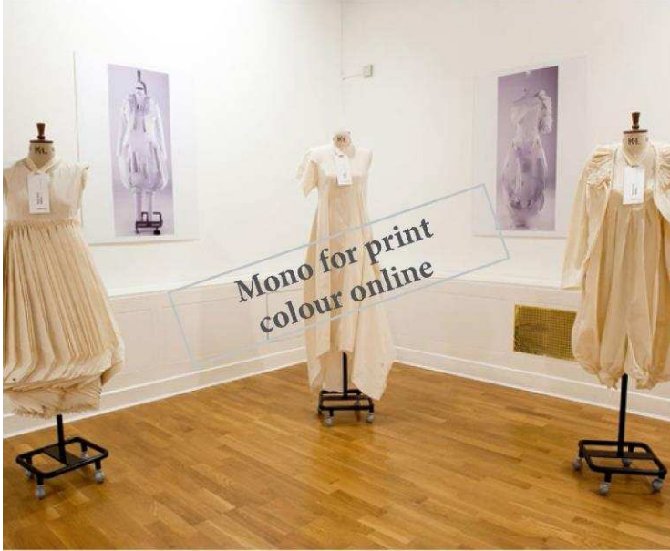
Figure 1. Sculptural forms in calico. From The First International Conference for Creative Pattern Cutting organised and chaired by Kevin Almond, 2013.