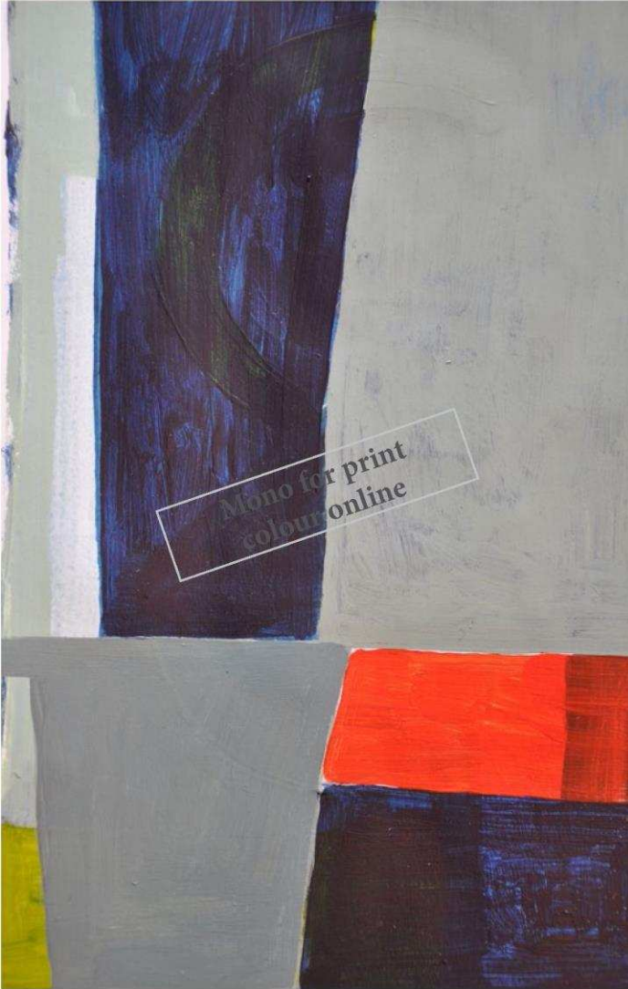
Figures 4 and 5. Sculptural Thinking. Paintings by Steve Swindells.