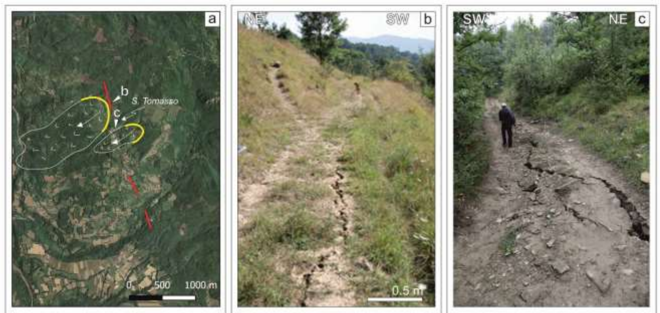
Figure 3: a) map of the Laga fault area: ground breaks are mapped in red; two known landslides are indicated (landslide crown in yellow –IFFI database; https://goo.gl/bE7uTN ); b) and c) location are indicated

For instance, in the lower part of the slope between San Tommaso village and the valley floor, several ground breaks were observed (Fig. 3). These fractures follow the slope orientation and consist of 20 to 25 m long surface breaks, 5 to 20 cm wide, N140 - N160 trending and west-dipping. The observed ground breaks are located near the head of a large landslide, suggesting that they may be tension cracks connected to the semi-crescentic crown of a seismically-triggered slide. The surface ruptures affect the colluvial deposits covering the area and we did not observe, if any, evidence of ruptured bedrock. Nevertheless, the affected area corresponds to the zone where, according to InSAR data, significant deformation occurred (i.e., max. 15 – 18 cm of LOS vertical component near this area, see Figure 1).