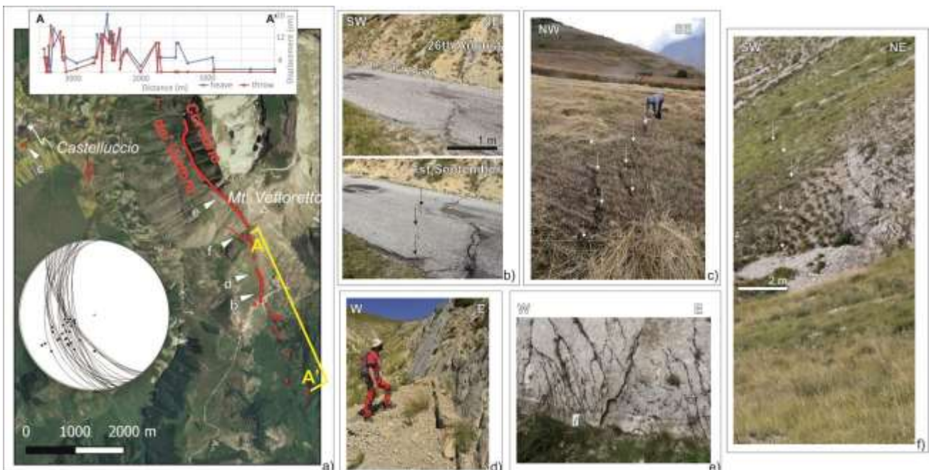
Figure 2: a) map showing of the Mt. Vettore fault area with mapped ground breaks (in red): structural data (displacement vectors and great circles for bedrock faults) and displacement profiles are also reported - Google Earth base image (8/9/2010); b - f) examples of ground breaks: note the typical right-stepping en-echelon pattern and the post-seismic movement documented in b).

A set of ground ruptures was mapped in the southern sector of the Vettore fault, along the E slope of Mt. Vettore (Fig. 2a A-A' sector). These ruptures show normal movement (slip vector ca. N240) with a minor left-lateral component, strike ca. N150, and commonly show en-echelon right-stepping. Data on recorded displacement are reported in Figure 2a. Ground breaks run continuously, from the road SP34 (Fig. 2b) at the south end, up to the end of Mt. Vettore slope, where the ruptures bend slightly downslope,