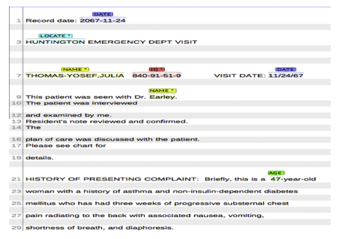
Fig. 1. Example of clinical record with annotated PHI categories.