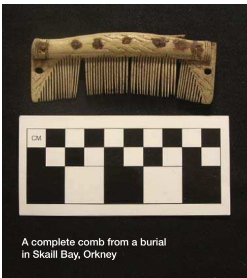
A complete comb from a burial in Skail Bay, Orkney

There is much published on this subject, not least in publications such as Deer ,