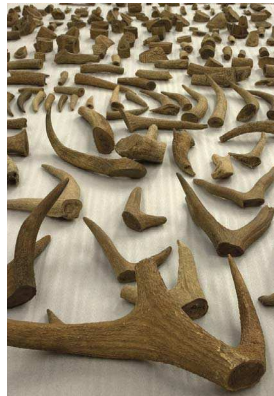
Figure 2. Antler waste from a Viking-Age pit at Hungate, York

To summarise, it is now clear that combs were made according to a process that was relatively standardised in outline (Fig. 3). A series of short, rectangular pieces of bone or antler were cut and prepared to form toothplates. These were then riveted between a pair of long strips referred to as connecting plates. The whole was then trimmed and decorated, teeth cut in the toothplates, and final polishing and finishing undertaken. There was, no doubt, variation in the detail of this sequence, 8,9 but the basic pattern is now well established. On the