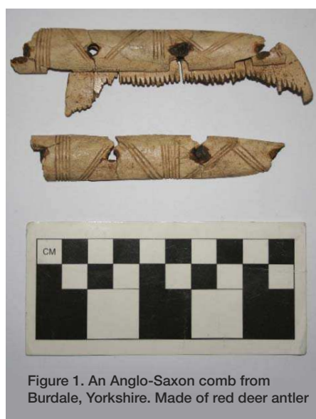
Figure 1. An Anglo-Saxon comb from Burdale, Yorkshire. Made of red deer antler

than are their wooden counterparts, which are dependent on exceptional preservation conditions (as at Coppergate, Viking age York, for instance) in order to survive.