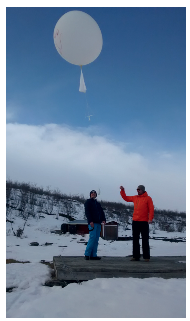
Fig. 2. Students releasing the last radiosonde of the week.

surface of Lake Torneträsk, close to the research station (Fig. 1). Surface energy budget contributions were calculated from up- and downwelling solar and infrared radiometers and eddy-covariance measurements of the turbulent heat flux. Direct measurements of the wind stress and indirect estimates derived from near-surface profiles of wind speed provided two different approaches to calculating the surface drag coefficient, which was then related to the variations in upwind topography with wind direction.