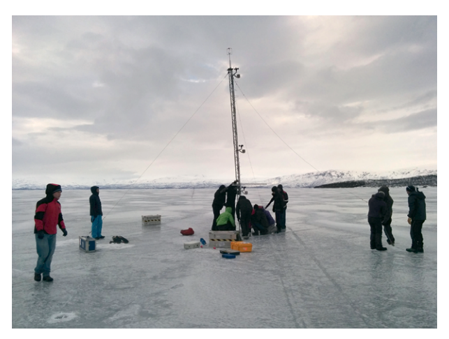
Fig. 1. Students helping to erect a mast on Lake Torneträsk.

theme of polar prediction. It was a joint initiative from the World Weather Research Programme (WWRP)-Polar Prediction Project, the World Climate Research Program (WCRP)-Polar Climate Predictability Initiative, and the Bolin Centre for Climate Research. Here we briefly describe the program, which was unique in combining polar weather and climate theory with modeling exercises and field meteorology techniques. Each of these components forms a crucial pillar of the prediction problem, and the motivation for combining these was to provide participants with a complete overview of the components required to understand and predict polar weather. The model of combining these components into a coherent course is recommended for future schools on weather and climate prediction at all latitudes. The school was well received by the students and formed part of the training program for the upcoming international Year of Polar Prediction (YOPP; 2017-2019).