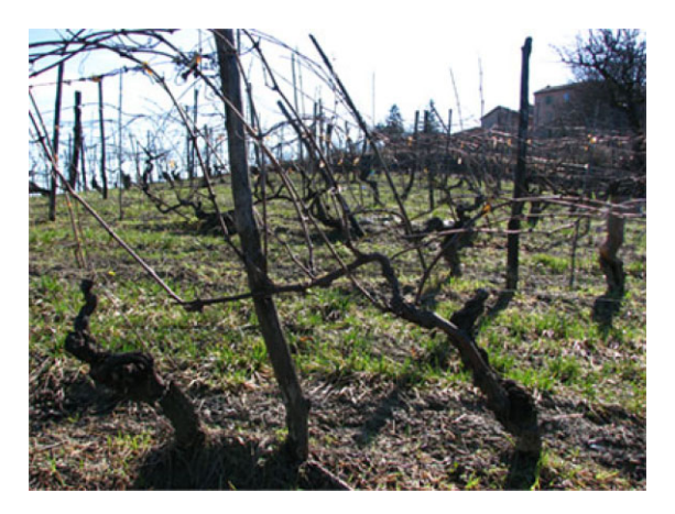
Figure 2 Vine before pruning