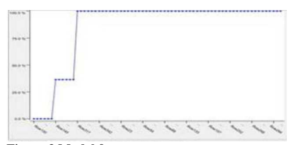
Figure 3 Model features accuracy

Our model shows a predictive accuracy of 88% in classifying the textual data. We then tested using the hierarchical classification function in Knime the ability of the classification model to deal with the addition of features. From Figure 3 we can see by feature 4 that the model peaked at 100% accuracy and then maintained this level of accuracy as features kept being added to it.