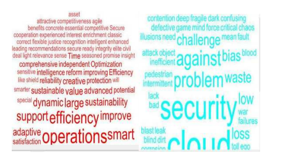
Figure 1 Tag clouds of positive/negative sentiment

Tag clouds were initially used to visualise our initial findings. A simple tag cloud presented in Figure 1 gives the most used words in the positive (left hand cloud) and negative used words (right hand cloud).