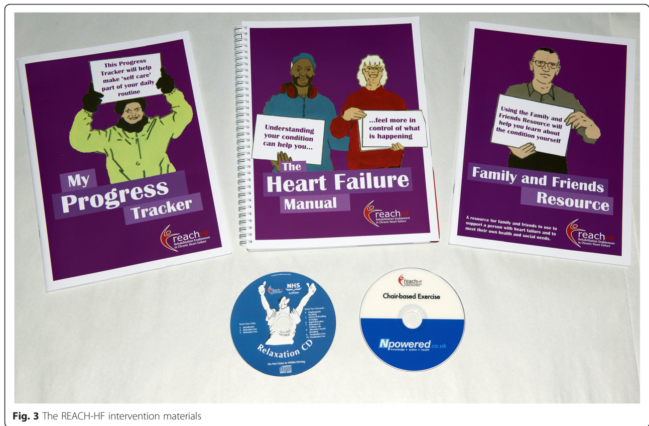
Fig. 3 The REACH-HF intervention materials

of patient backgrounds, knowledge levels and severity of heart failure.