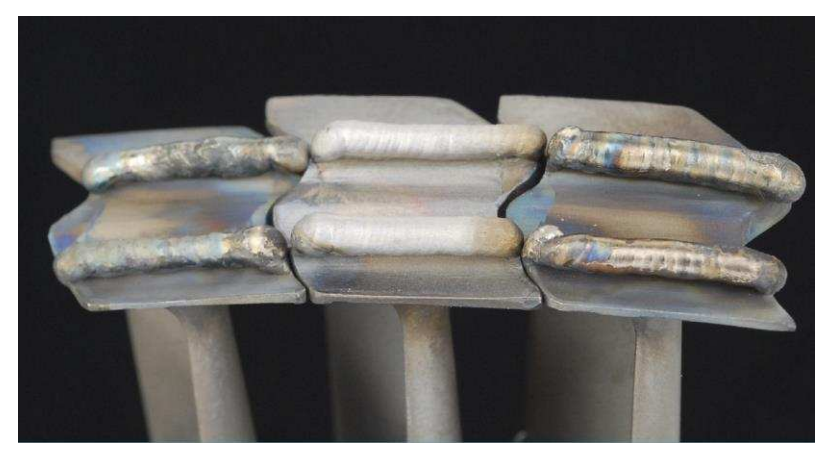
Fig. 4. Photograph of compressor blades after manual weld deposition

data available. The remanufacturing industry relies instead on highly skilled welding staff to "feel" their way through a blade repair (Fig. 4 shows compressor blades after manual weld deposition).