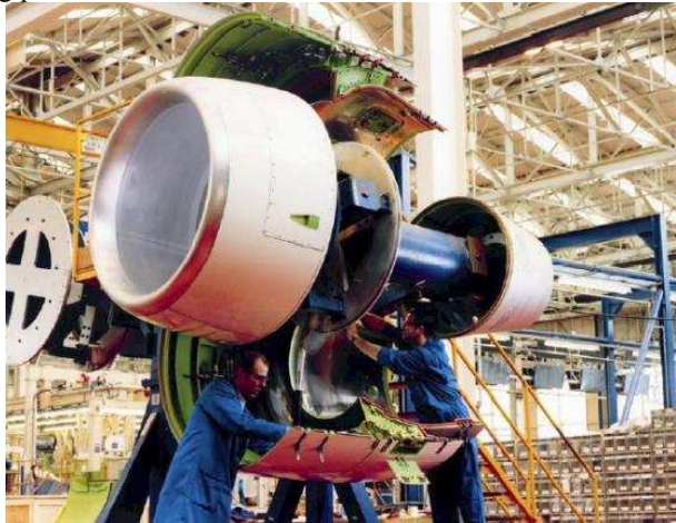
Fig. 6. Manual maintenance, repair and overhaul for aircraft engines.

The aim of this specific prototype system will be to detect the incoming parts, assess the shape, profile and type, inspect the condition then move the robotic arm ensuring correct position for the weld to be conducted. This is of critical importance to the aerospace re-manufacturing industry as many parts consist of unique shapes, profiles and sizes. Not only will the automated process result in direct cost savings for industry, when combined with advanced real-time weld monitoring systems it will also allow non-destructive testing and component evaluation for system control during the welding process.