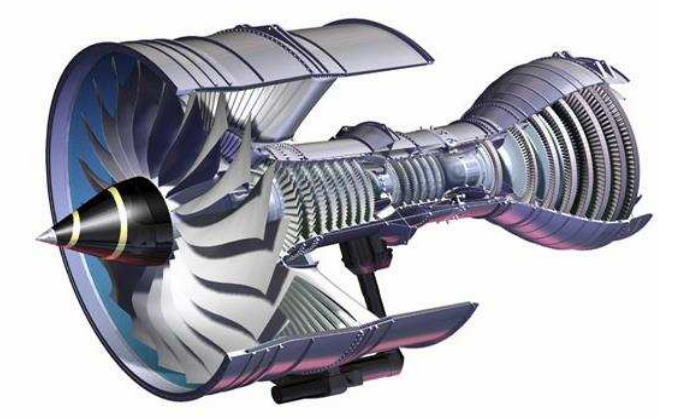
Fig. 1. Cross sectional rendering of Rolls-Royce Trent1000 turbofan engine detailing the removable compressor blades in the central section

Aero engine gas turbine compressor blades are subjected to extreme temperatures during operation, resulting in wear, deformation and distortion over time (Fig. 1 shows a Rolls-Royce Trent1000 turbofan engine). The overhaul process is predominantly undertaken manually. In this instance we discuss the high value compressor blades which are stripped from their mountings, removed and repaired using manual weld deposition then refinished.