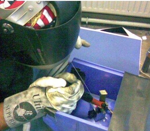
Fig. 5. Photograph of a skilled welding engineer performing a manual weld deposition operation on a compressor blade

Solution: The use of robotic systems for welding operations, removes the necessity for workers to endure prolonged periods sitting down. Furthermore robotic systems are more productive because they can operate in a continuous manner for long periods of time without stopping.