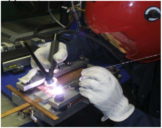
Fig. 3. Photograph of welding engineer carrying out the manual weld build up process.

Turbine compressor blades experience dimensional and metallurgical degradation during engine operation. Dimensional degradation derives from wear, nicks, dents and hot corrosion. The current solution is to grind back the blade tip to a predetermined globally approved specification which results in non-defective sectors being reworked unnecessarily which significantly reduces the lifespan of the part (Fig. 3 shows the manual weld build up process).