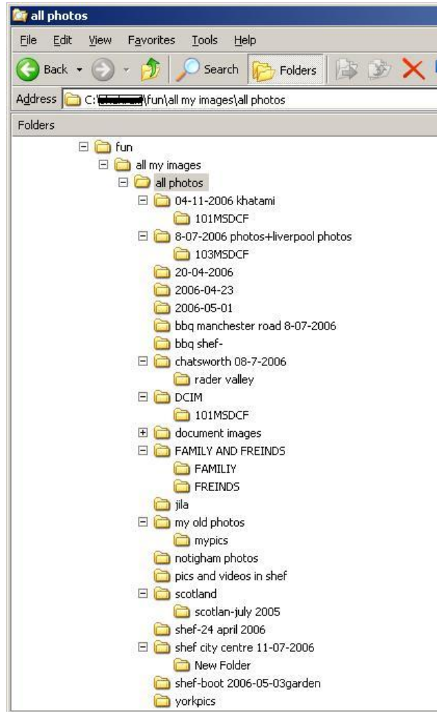
Figure 2: Typical Folder Organisational scheme showing heterogeneous folder names

were uploaded at the same time). This made identification of the correct folder and picture hard.