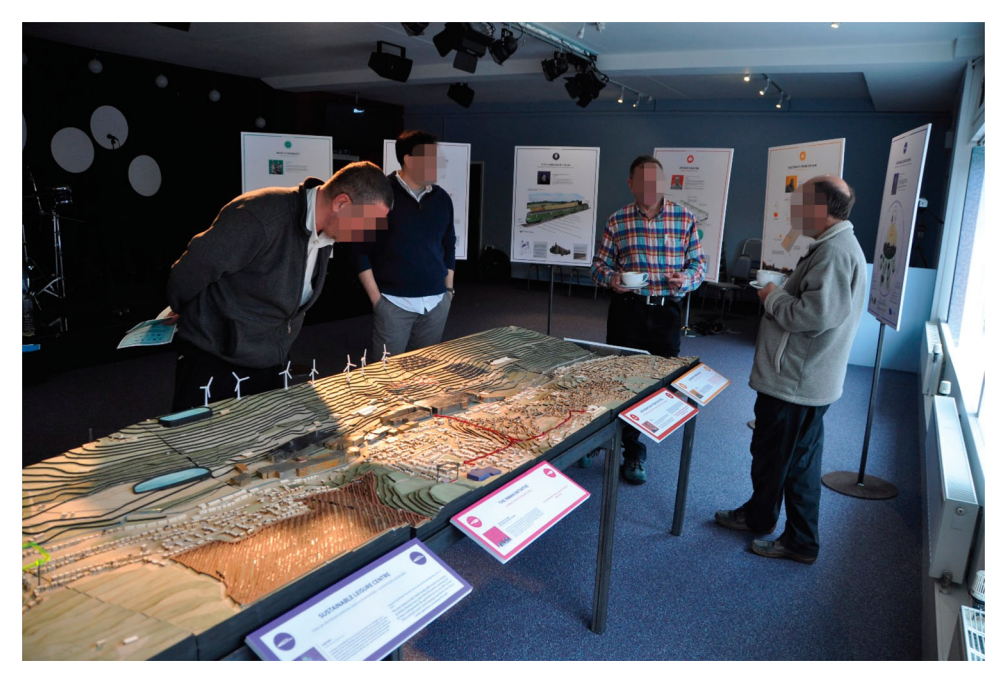
Figure 3. Solar Energy in Future Societies (SEFS) academics and participants interacting around the scale model and related posters in the lead up to the final exhibition. For the posters, see the supplemental data online.

As a result, the final physical model sought to illustrate both visionary and innovative ways of matching local energy generation and demand developed by the participants, and more 'achievable' technology deployment. Figure 3 shows the physical model with accompanying posters giving further detail on socio-technological solutions illustrated by the model: