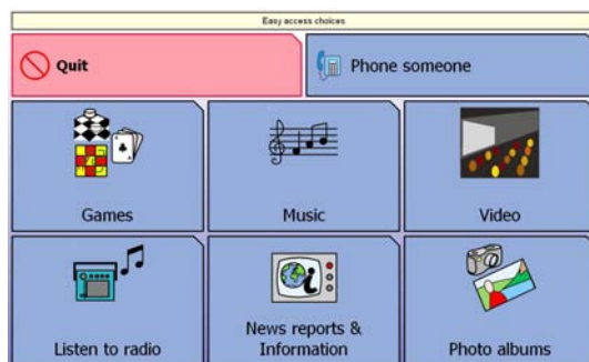
Fig 1. SIM WIN system (screenshot)

improve social interaction and networking to family and friends through videoconferencing facilities. The motivations behind the development of SIM WIN was to provide a means of mental stimulation, as an alternative (or complementary) to the traditional social activities existing in UK residential care homes. The University of Sheffield leads the SIM WIN project, in collaboration with Barnsley Hospital and a non-for-profit residential care home provider based in Sheffield, UK.