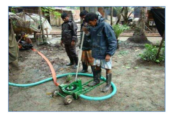
(e) Diaphragm pump