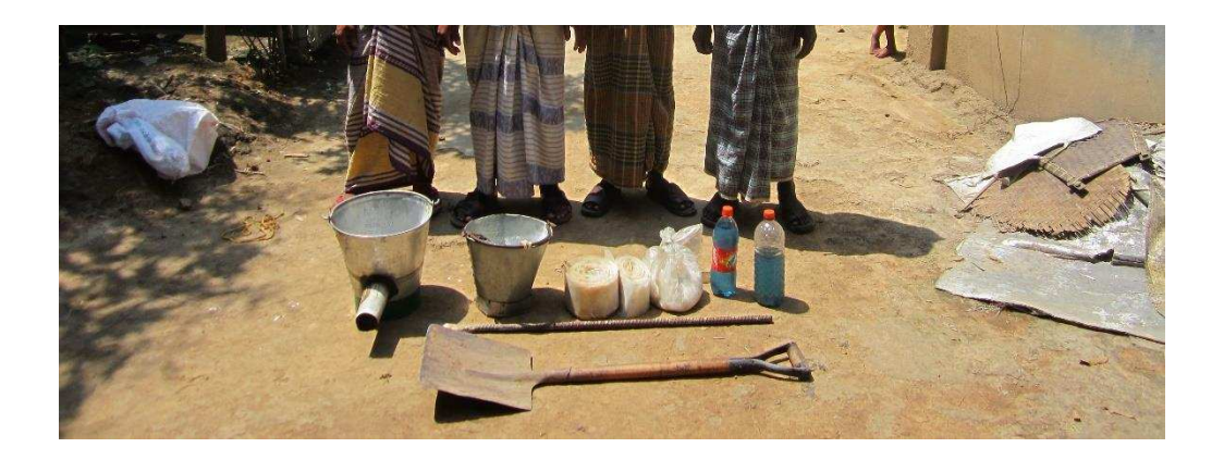
Figure 1: Simple tools currently used for pit emptying

To identify appropriate technologies for emptying pit latrines, it is necessary to first assess the volume of sludge that needs to be transported annually, which is based on the numbers of pits and their frequency of filling. Second, the exact nature of the hazardous materials to be emptied needs to be characterized in order to identify appropriate strategies to reduce risks to those who would handle sludge. Finally, appropriate, locally available technologies for safer emptying of pits need to be identified. We examine these three factors for one subdistrict in Bangladesh. The subdistrict is envisioned by the NCFSM as the scale at which services would be designed.