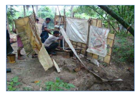
(a) Gulper pump