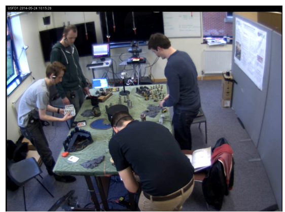
Figure 1: SWC2 recording (from Camera C1 in Fig. 2).

covering different environment conditions that also have natural speech. Existing research corpora of real multi-channel distant recordings often use artificial scenarios, read speech and re-recorded speech. Examples are the real recording part of MC-WSJ-AV corpus [28] used in ReverbChallenge 2014 [6], or the CHiME corpora [29]. Other corpora are recorded with controlled environment and speaker movement, such as the meeting corpora AMI [30] and ICSI [31].